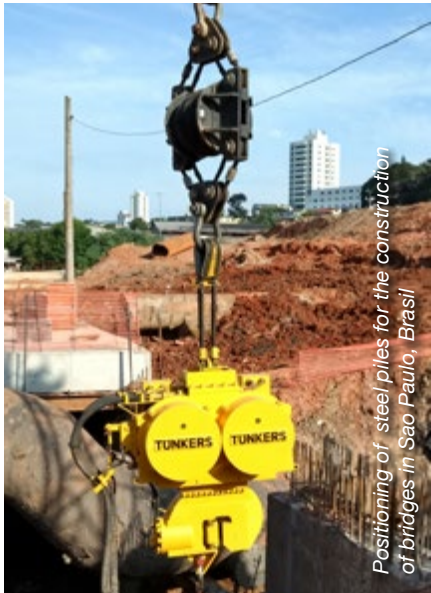
Positioning of steel piles for the construction of bridges in Sao Paulo, Brasil